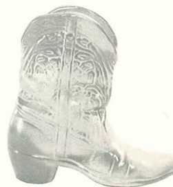
133—6½" BOOT VASE—2.50