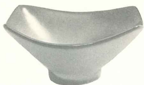
F34—8" RICE BOWL—2.50