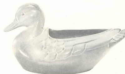
208—12" MALLARD PLANTER—5.00