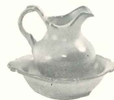
40AB—PITCHER & BOWL SET—3.50