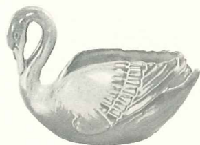
228—8" SWAN PLANTER—3.50