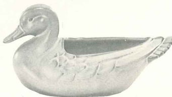
208A—9½" MALLARD PLANTER—3.50