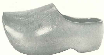
913—9" DUTCH SHOE PLANTER—2.50