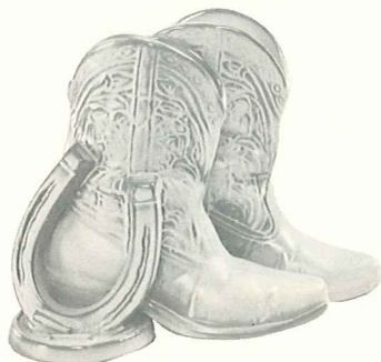
433—BOOT BOOKENDS—10.00 pr.