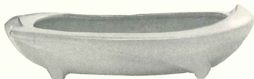
45—12" OBLONG PLANTER—4.00